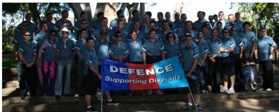
2008 Mardi Gras Parade Defence Contingent

Don't forget, after the Parade, we'll be heading to the Paddington RSL for a few refreshing drinks, so come and join us.