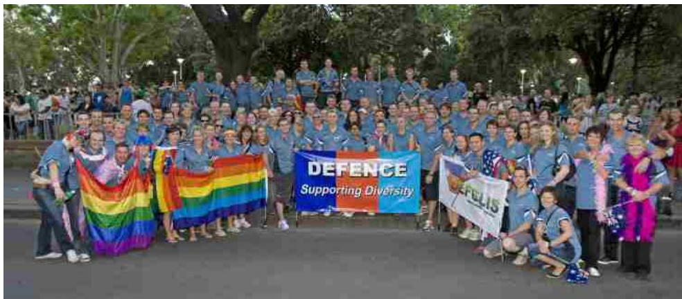
2009 Mardi Gras Parade Defence Contingent